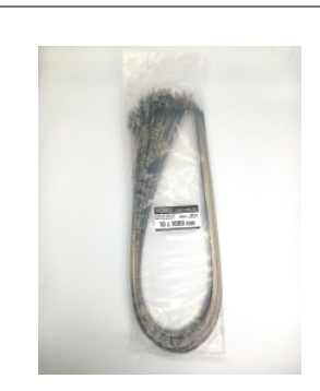
Pictures of products and dimensions are approximate and subject to technical changes (with a tolerance of \pm 5%).